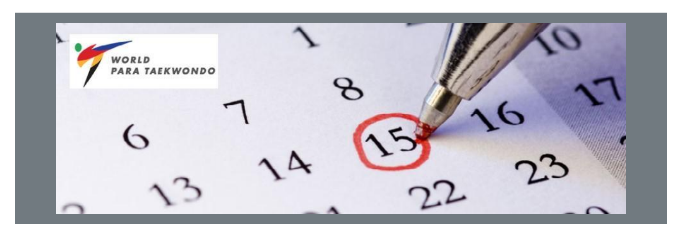
2023 (Provisional calendar subject to change)

• 2023 Egypt Para Taekwondo Open (G1) - February 16 - Cairo, Egypt