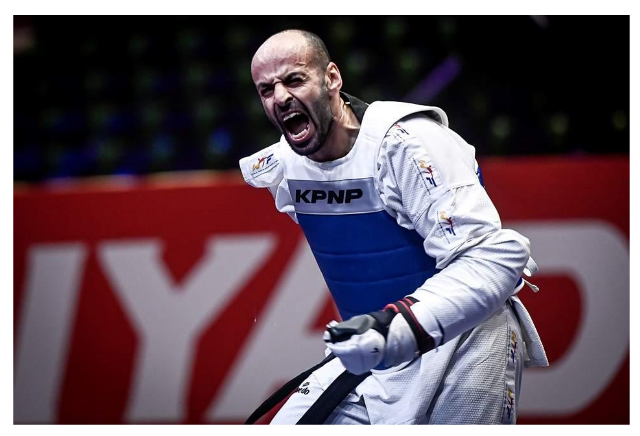
Iran set a record with four gold medals, athletes from Nepal and Israel made history, and Para Taekwondo's best were feted at the Gala Awards at the season-ending Para Grand Prix Finals in Saudi Arabia.

It was a historic day in Riyadh, Saudi Arabia as Para Taekwondo made its Grand Prix Finals debut – and the athletes responded with history-making performances.